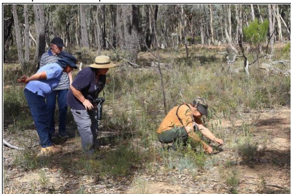
Left: FoK volunteers photographing local wildflowers (RS)

The production of the “Orchids of the Inglewood & Kooyoorra Areas – Field Guide. The first print run sold out within a few months. We have just received the books of the second print. We received 50% sponsorship of the first print run from Djaara and $ 3,500 from Bush Heritage for the second print run. The draft of the group's next publication of a Field Guide of the local Butterflies, Dragonflies, and Damselflies is progressing well. They are planning to have it completed, printed, and released prior to Christmas this year. They successfully applied for a grant from the Parks – Volunteer Innovative Fund. Friends of Kooyoorra have been awarded $ 13,517 for a project titled “Bush Colours” which is aimed at producing a free Flora Field Guide and conducting related activities in conjunction with Djaara especially aimed at children. Friends of Kooyoorra have also hosted a birding weekend and many tours within the local area. During the year Fok has strengthened their relationships and partnerships with local stakeholders. - Rob Scholes