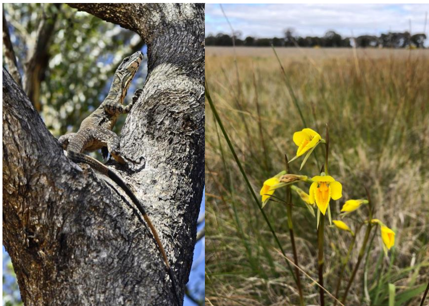
Above Left: Tree Goanna Along Boort-Kurting Rd. Above Right: Golden Moth Orchid, Fiery flat

LPLN attended a workshop to provide further feedback as part of the biodiversity 2037 evaluation.