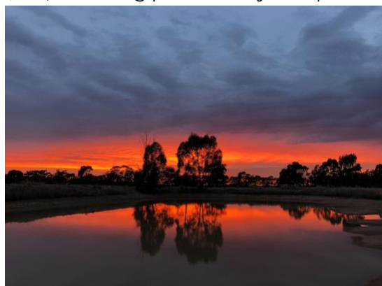
Above: Dam sunset Powlett Plains

Landholders seemed genuinely pleased that these sites and projects were re-visited with most sites having works undertaken a decade ago. Consultation occurred throughout May and June with works proposed for 16 different Landholders. the project works for the financial year completed with plans presented to NCCMA with works totalling $100,000-$120,000 being provisionally accepted.