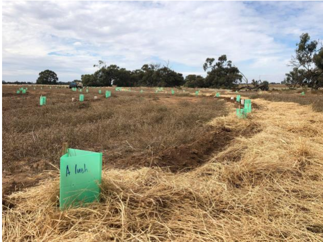
Above: Mysia revegetation works. (JvT)

Sites were identified with works planned and some works complete.